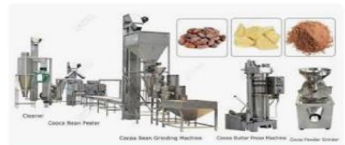
7. 300kg/hr cocoa processing line for dry cocoa beans