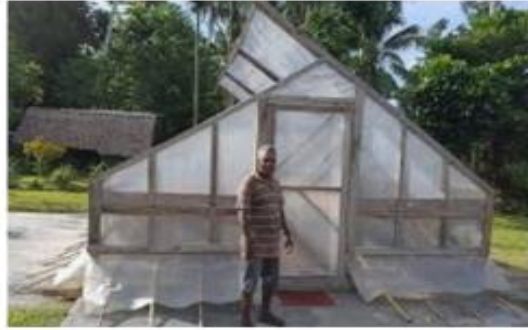
4a. post-harvest and quality management

The full involvement of the business in the PNG cocoa supply chain from cocoa farming and production to manufacturing and shipment to overseas markets.