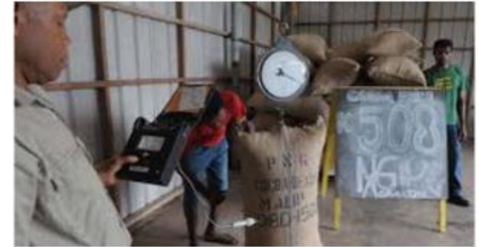
6. Buying point – quality control and management