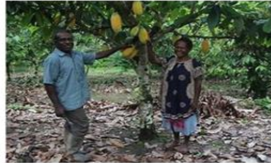
3. Farm and crop management