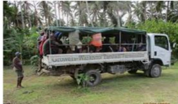
5. Transportation to a buying point