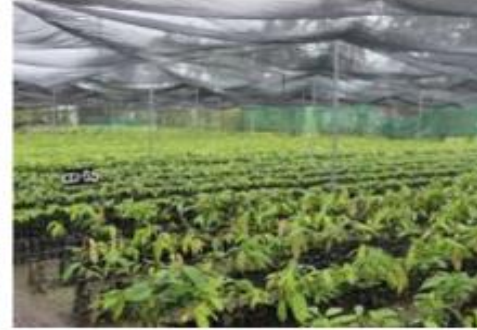
2. Nursery hubs to cocoa farms