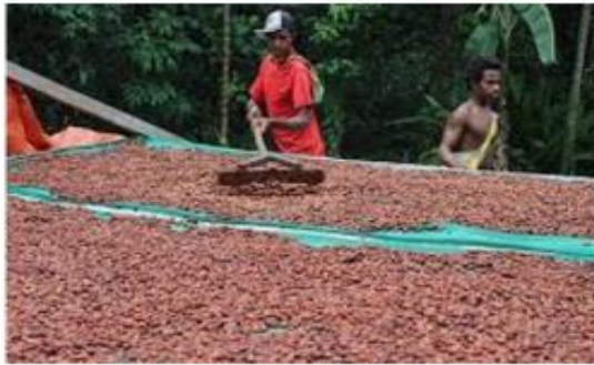
4b. post-harvest and quality management