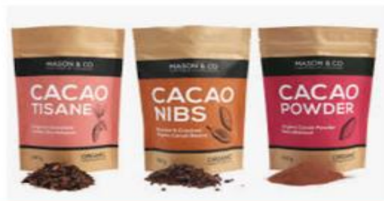
8. Semi-finished products for overseas buyers