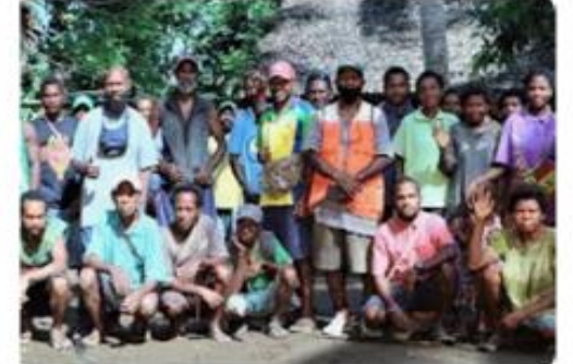
1. Farmer Cooperative Societies